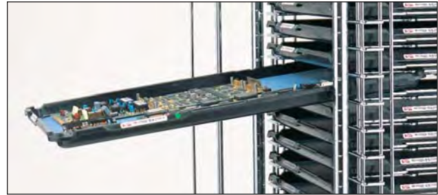
SmartTray™ engages with wire cart design to provide optimum ergonomic access.